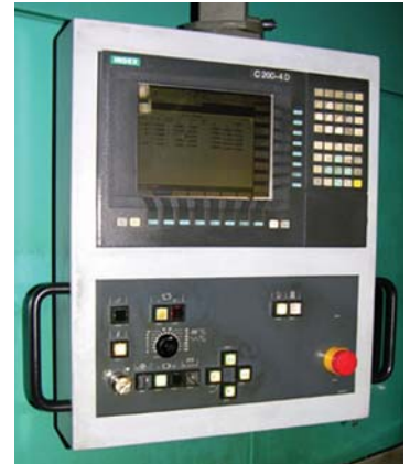
Above: Siemens SINUMERIK 840D CNCs control all axis and spindle motion, as well as various safety options on the machine tools. Programming is done via simple text instructions.

Index engineering has been assisted by various Siemens personnel in the application of CNC on this builder's machine tools. Cited for their contributions specifically by Index were the Siemens technical field service and engineering departments, whom a company representative said, "...were there for us whenever needed, striving to meet our needs and to meet or beat all our expectations." ■